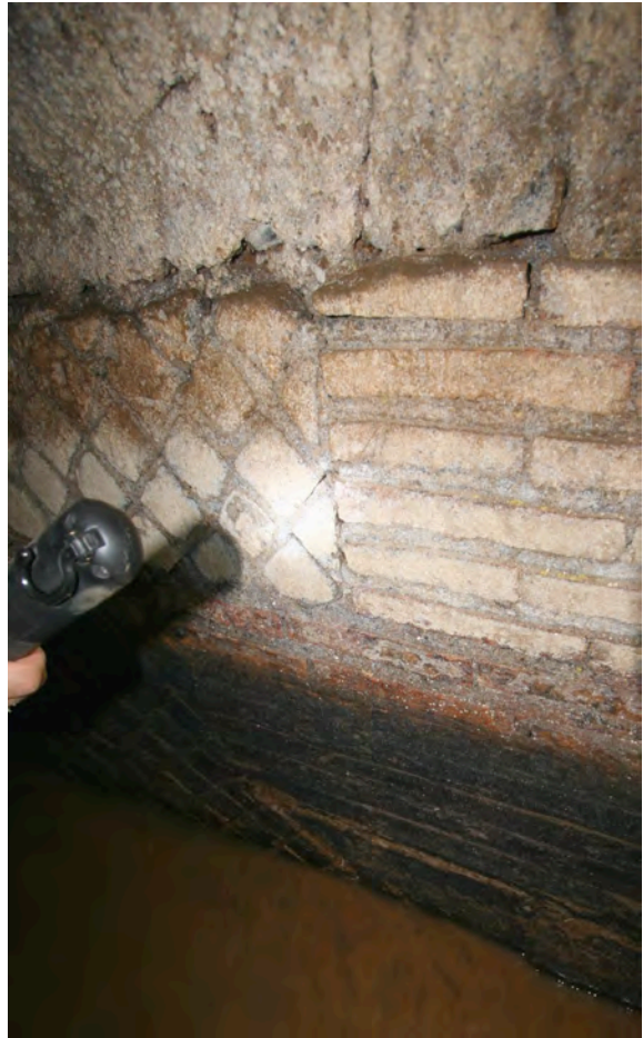
Fig. 12. Masonry seam between the opus testaceum filtration gallery and the opus reticulatum specus (R. Taylor).

its niche, which seem to have been converted into a devotional shrine. Very little of the church's superstructure survives, but blocks of dressed masonry can be seen in the underbrush above the grotto. The church became a hermitage preserving a miraculous portrait of the Virgin, the "Madonna della Fiora". 17 Well after the property came into the hands of the Orsini in 1491, maps (chiefly of the 17th-18th c.) began to represent the church in a formulaic way, with simple gabled roof and small campanile , yet in a few instances water is shown gushing from beneath the building (as on fig. 4, feature M). On a map of Vicarello