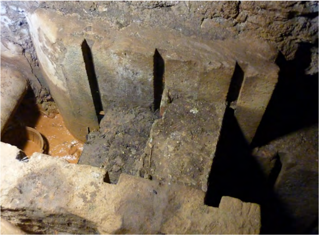
Fig. 16. Sluice-gate system at the junction (E. and M. O'Neill).

the nature of the property at that time (figs. 17-18). 24 The church (labelled “chiesa et eremitorio”) is shown at the center as a gabled structure with a campanile . Directly in front of the entrance, a narrow piazza extends down to a road. At its center stands a monument bearing the cross of the Ospedale di S. Spirito. Feature G, identified as a chiusino directly alongside the road, is unmistakably the junction hut. Feature F, labelled “pozzo d’acqua corrente” and lying directly between the source and the hut, can probably be identified as the ‘mother-shaft’ of the Traiana conduit, only a short distance from the source. A nearby tree appears to function as the pivot for a shaduf , a water-lifting device with a weighted boom. This well was probably the principal water source for resident monks, field laborers and visiting pilgrims. If by this time the bulk of S. Fiora’s water was destined for grain mills at Vigna Grande, then the local privilege of hauling up water from the conduit by hand bears a striking resemblance to the legal rights of landholders who lived along the course of Rome’s ancient aqueducts. 25