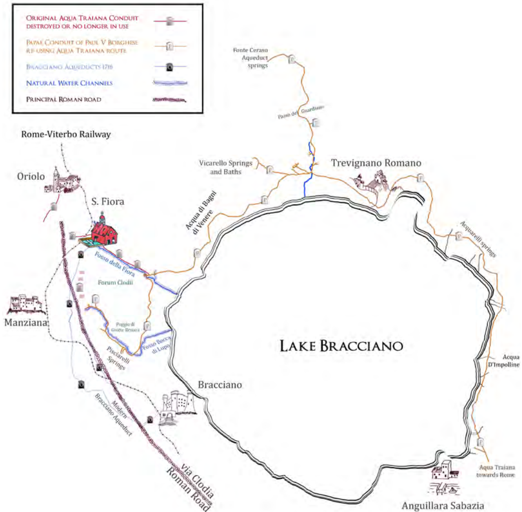
Fig. 3. Map of the sources and conduits of the Aqua Traiana in the Lake Bracciano region (© E. O'Neill). Information drawn from Cassio 1757; from Carta Topografica dell'Istituto Geografico Militare f. 143, tav. III N.E.; from Archivio di Stato di Roma, Disegni e Mappe, coll. I, cart. 10, n. 113 bis; from Archivio di Stato di Roma, Collezione Ospedale di S. Spirito (fig. 17 below); and from measurements made in the field.

defunct but that their advantages were lost to Rome, for at that time the waters were serving the town of Bracciano abundantly. From the mid-19th c. until the recent rediscovery of S. Fiora, the sources went virtually unremarked. Discouraged by Lanciani's failure to identify them, archaeologists and aqueduct-hunters were content to focus on the specus , which comprises a few visible ruins in the field and miscellaneous segments that were incorporated into the Acqua Paola , the Papal reconstitution in the early 17th c. of the ancient aqueduct. 4 The latter-day aqueduct still delivers a healthy volume of water to Rome, most famously through the grand fontanone of Paul V on the Janiculum. While still potable, it