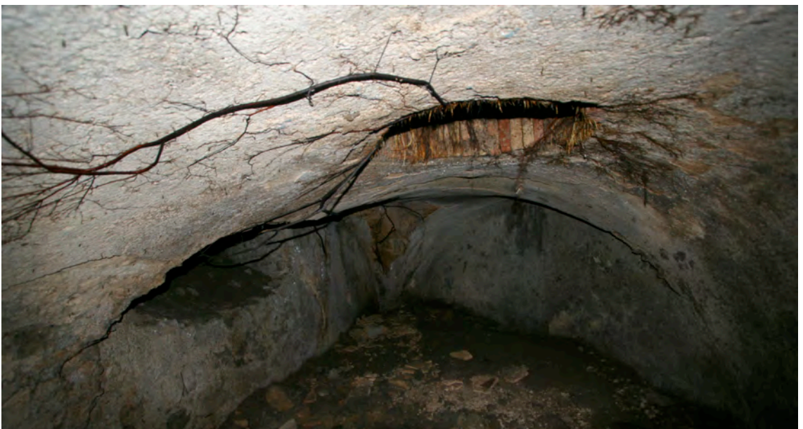
Fig. 6. Left chamber (R. Taylor).