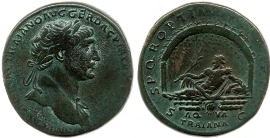
Fig. 2. Sestertius of Trajan, A.D. 109-117.