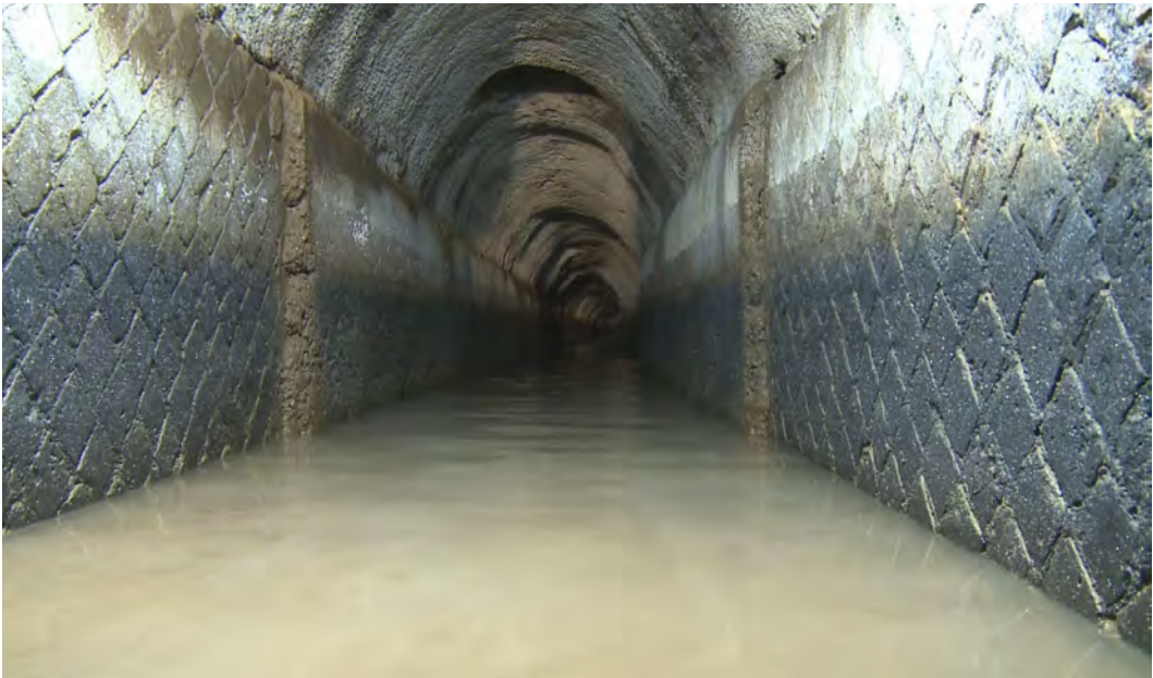
Fig. 11. Junction of the downstream filtration gallery and the lined aqueduct specus (E. and M. O'Neill).

the axial statue niche (presumably either of Trajan or a local nymph 14 ), and the evidence for wall- and vault-decorations indicate that the place was intended for presentation to