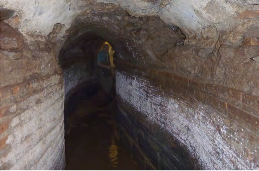
Fig. 10. S-curve in the downstream gallery (E. and M. O'Neill).