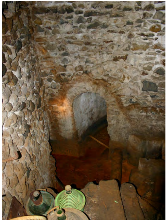
Fig. 15. Junction of the Bracciano aqueduct and the Aqua Traiana below the hut (E. and M. O'Neill).

A plat map dated to 1718 not only presents the church and its surrounding properties in unusual detail, but also provides many clues about