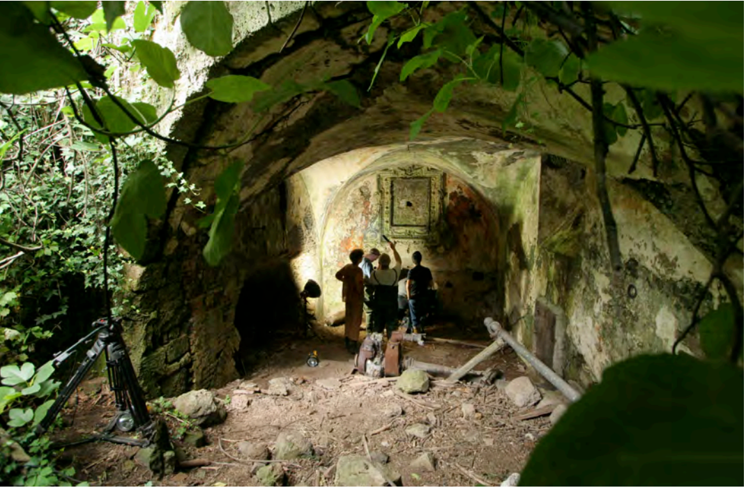
Fig. 1. Grotto of S. Fiora, general view.