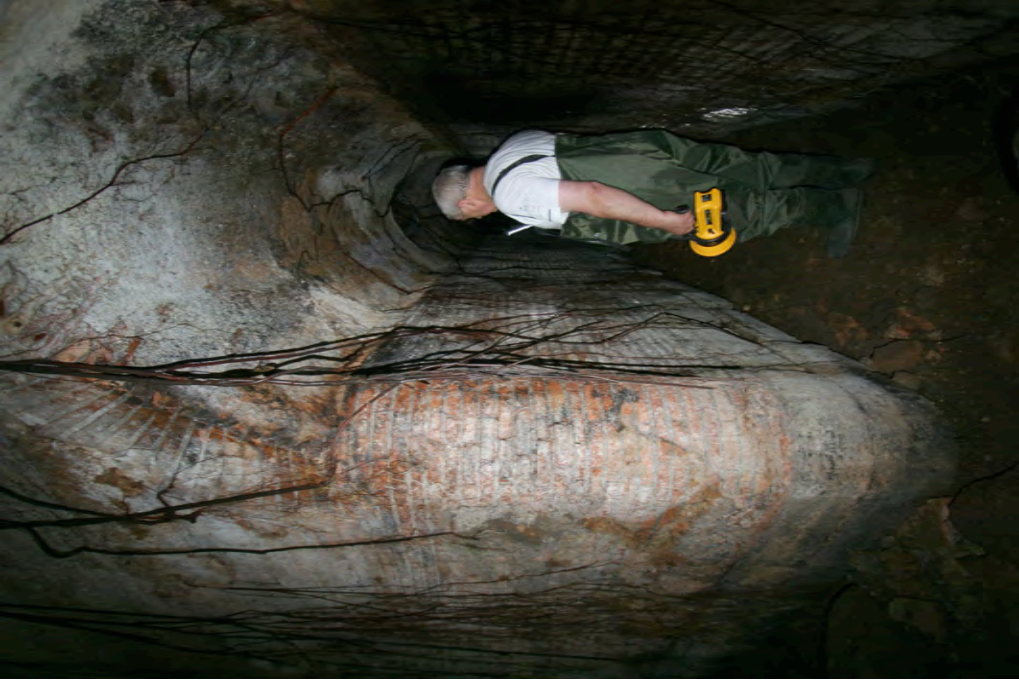
Fig. 8 [right]. Entrance to the gallery extending downhill from the right chamber (R. Taylor).