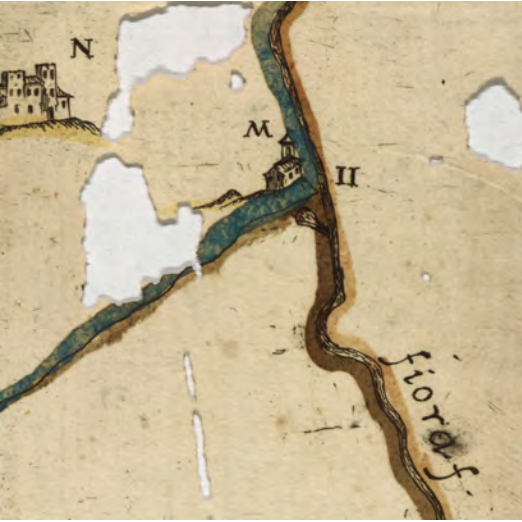
Fig. 13. Detail of map of the Vicarello region in 1687.

it far too valuable to ignore; 18 but it was already in use, and its sale was non-negotiable. In 1573 Paolo Giordano Orsini had conducted the Fiora's waters to Bracciano's territory in a new conduit, 19 which ran from S. Fiora along the Fosso della Fiora to Vigna Grande. There it powered several valuable mills (fig. 4). 20 Along the Fossa the new channel roughly paralleled the ruined Traiana ; Ashby found relics of the latter's broken specus there, not far from the source. 21