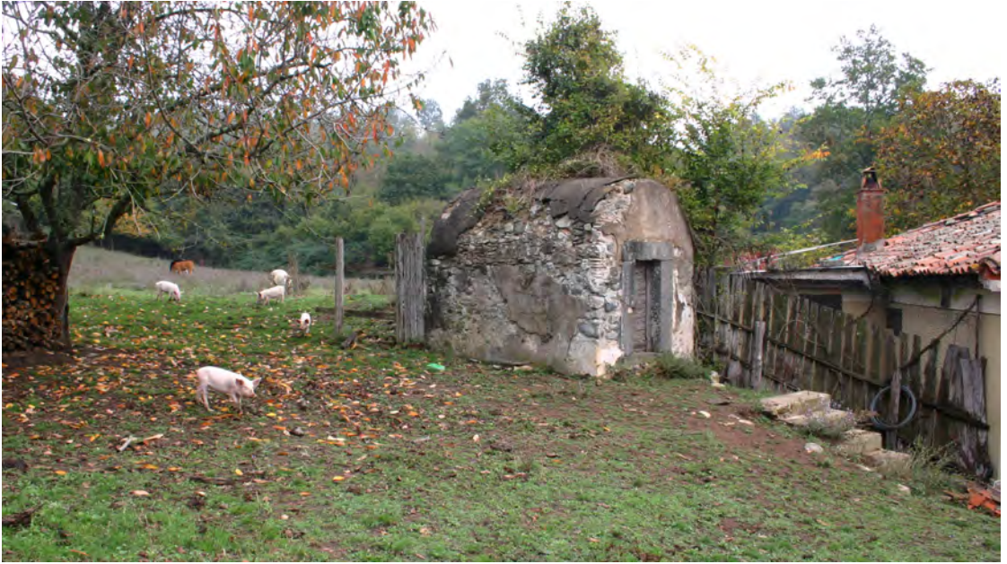
Fig. 14. Masonry hut above the chamber joining the Aqua Traiana to the old Bracciano aqueduct from the Fonte del Gatto (E. and M. O'Neill).

della Fiora. Not far downstream, both Ashby and Van Deman reported the presence of a deep pool that had eroded away parts of the specus . 23 This they took to consist of surface water flowing down the Fosso, but more probably the conjoined aqueducts themselves created the pool from their overflow. At the junction hut, a resident waterman continued to operate the gates until 1984, at which time new wells for Bracciano were drilled alongside S. Fiora. Some of the wooden gates controlling the Traiana conduit remain in place, the gaps between them filled with sediment (fig. 16). Our fieldwork suggests that the Aqua Traiana conduit crossed the Fosso and paralleled it on its E side; we hope to investigate this area further in future seasons.