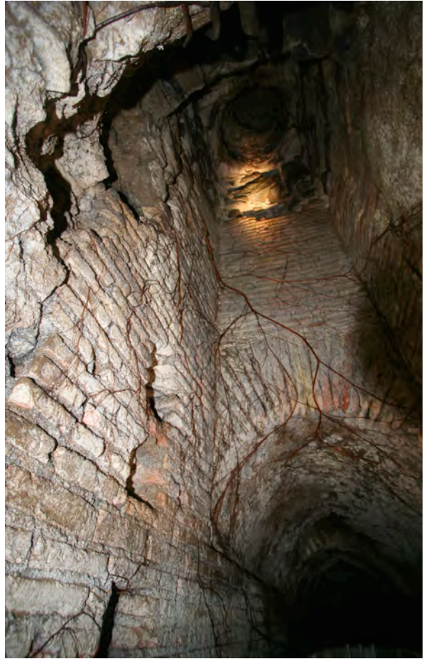
Fig. 9. Service shaft in the downstream filtration gallery.

For about the first 50 m, the downhill gallery combines conventional features of a Roman aqueduct specus , namely a concrete barrel-vault punctuated by vertical service shafts, with the wall-filtration system and dirt floor of the springhouse. No part of this hybrid sector of the aqueduct shows any evidence of being excavated from living rock; it was built in the cut-and-cover technique, excavated down from the surface. Like the oculus shafts in the grotto chamber, the vertical service shafts have been blocked, but fig roots infiltrate them and run long distances down the gallery, detaching the plaster or opus signinum linings on the vaults and walls. Unlike the first service shaft, which is fairly narrow and circular in section, the second is the full width of the gallery and square in plan; its walls are lined in opus latericium for at least 2 m above vault level (fig. 9). Irregular toeholds are visible along its sides. This may have been a ‘mother-shaft’, a point of origin, reference, and supply, from which early phases of construction proceeded.