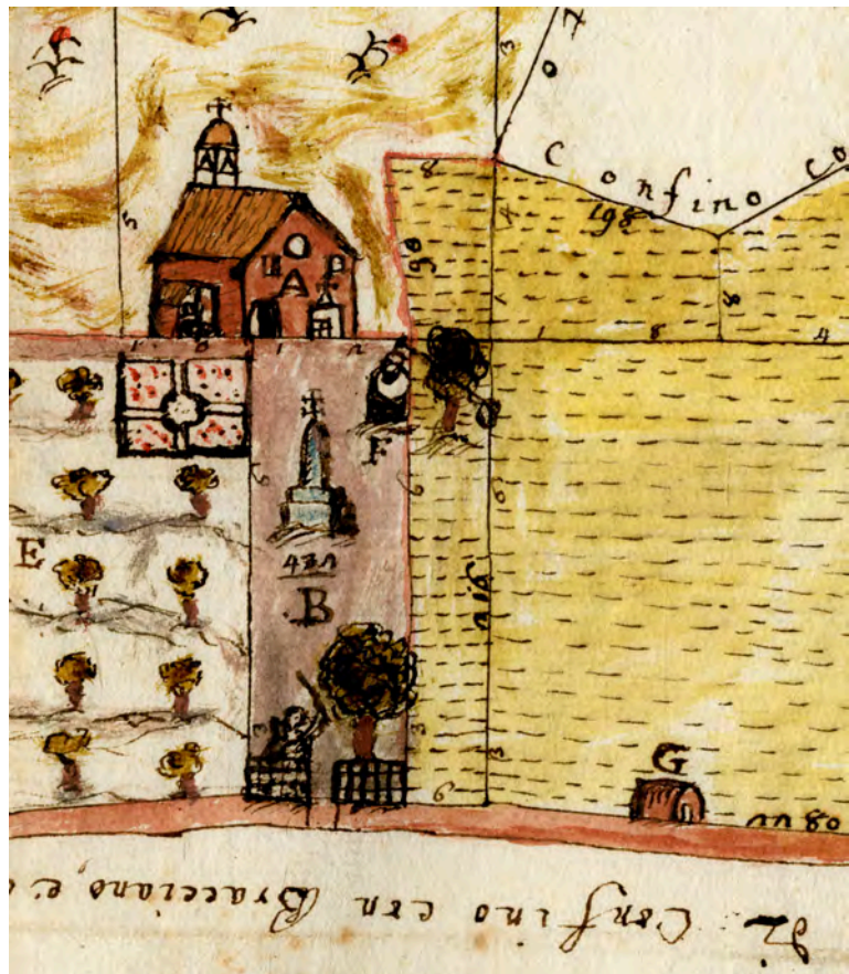
Fig. 18. Detail of fig. 17.