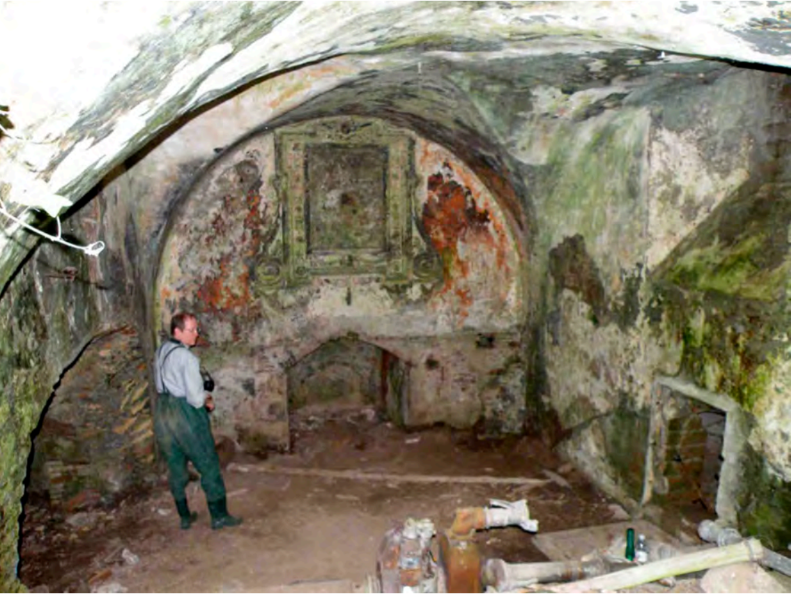
Fig. 5. Interior of the central chamber (K. Rinne).