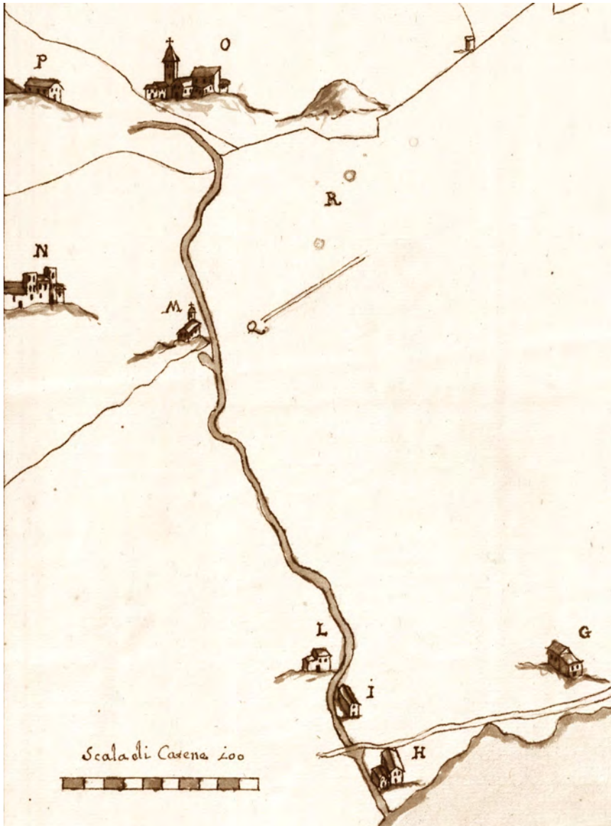
Fig. 4. Detail of a map of 1716 of the Vicarello region. S. Fiora is feature M; Vigna Grande is H. The mills are labeled L and I. The grain mill was on the Bracciano (W) side of the stream, the oil mill on the Vicarello (E) side.

long served as the boundary between the territories of Vicarello on the east and Manziana and Bracciano on the west.